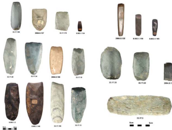
Fig. 3. Variety forms and sizes of polished stone gouges and chisels occurring in the collection of Samrong Sen.

obvious. For the moment, the suggestion that stone tools from Samrong Sen were made from local material is still questionable.