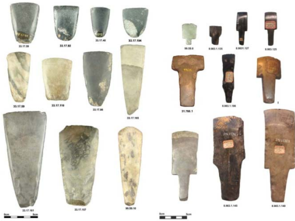
Fig. 2. Variety forms and sizes of polished stone adzes shouldered adzes from Samrong Sen.